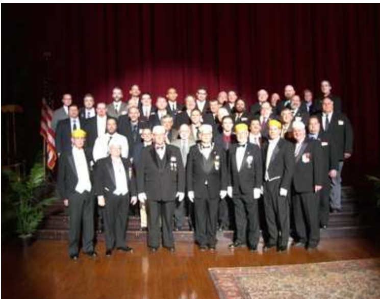
The Bradford A. Goebel Class, Fall 2010