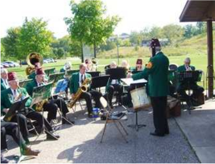
Shrine Band performs at the 2010 Learning Center Walk