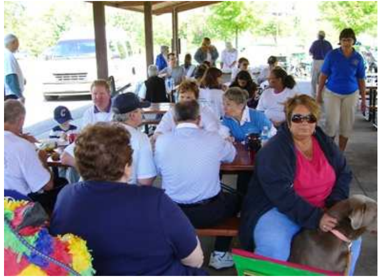
Lunch at the Learning Center's 2010 Walk